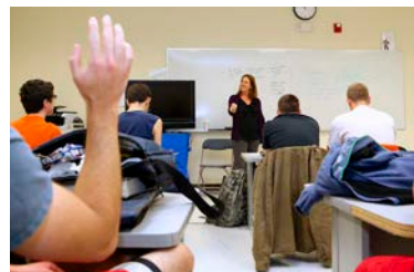
College level courses are supplemented by classwork in independent living skills, career prep, financial literacy and social competency.

Offered in collaboration with local community colleges, the Standard 9 Scholars and Exploration tiers serve students with college aspirations at varying levels of readiness based on Accuplacer® test results for college level course work. Students may take remedial courses with or without in-class staff support; others may also take college level courses in areas where Accuplacer® requirements are met at the discretion of the IEP team. In addition, both tiers integrate a comprehensive transition curriculum.