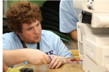
Paid school-to-work jobs and community internships

Designed for students who plan to enter the workforce, this tier offers paid on-campus jobs and community internships. Students benefit from instruction and hands-on experiences that target work readiness, independent living skills and practical academics. They gain practical experience through community-based instruction, and through Y.E.S. Designs, a school-based enterprise. Social skills training is integrated throughout the program.