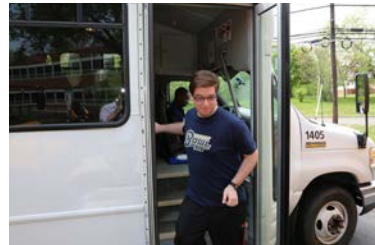
Mobility training and community-based instruction

Students receive a challenging introduction to the business world in a seminar style format, and have opportunities for on-the-job mentoring from college interns. Students gain exposure to advanced skills including 3-D printing and document scanning, along with business planning through Bright HorizonS9, a student enterprise. A full transition curriculum builds work readiness, independent living, social competency and essential academics.