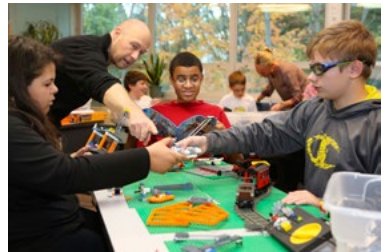
Intensive social skills curriculum combined with academics, transition support, and career preparation

Upper School, Lower School, and Standard 9