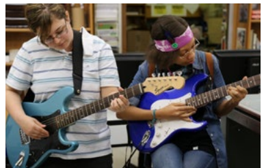
Interest-based clubs and activities including computers, art, music, fitness, intramural sports and more