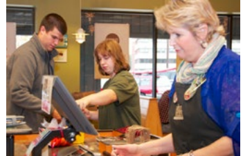
Transition preparation, life skills, & community job-sampling