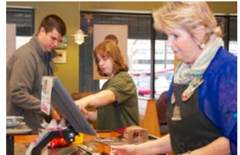
Transition preparation, life skills, & community job-sampling