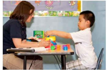
ABA-based instructional methods